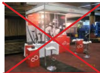
Keep all furnishings inside the stand