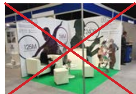
Do simple bold graphics