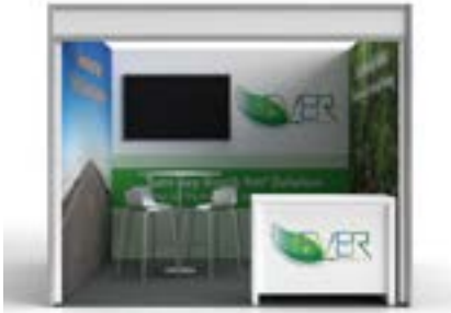
Add screens for attention, appropriate amount of furniture