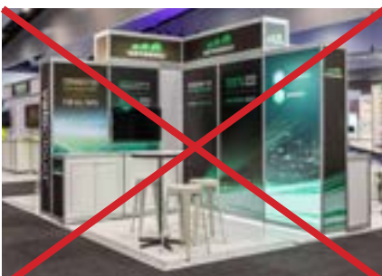
Do not exceed 2.5 meters in height