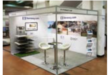
Use lighting to stand out from other booths