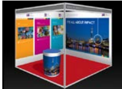
Bright Simple Graphics