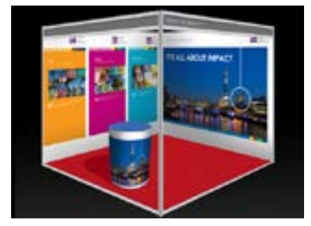
Bright Simple Graphics