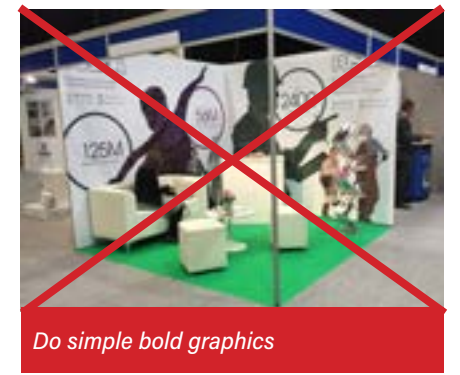
Exhibitors found to be in violation of display rules will be asked to make modifications on site. If modifications are not made, exhibitor will be prohibited from attending the show and rebooking for future events.

Any items in found in the aisles will be removed by show mangement and disposoal will be charged back to the exhibitor.